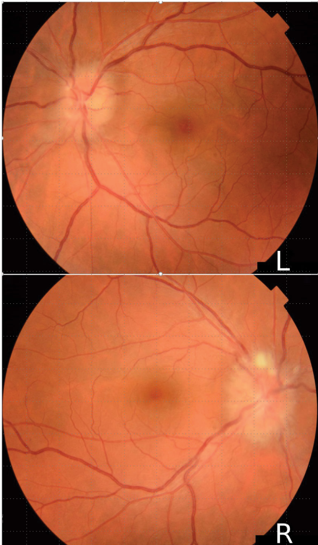
Figure 1 Fundus examination showing bilateral papillary edema stage 3.

The repeated ophthalmologic examination showed a regression of the papillary edema passing to stage 1.