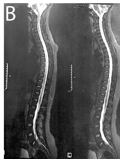
Figure 2 Sagittal (a) and axial (b) T2 weighted MRI showing high-signal intensity throughout the cervical, thoracic and lumbosacral cord.