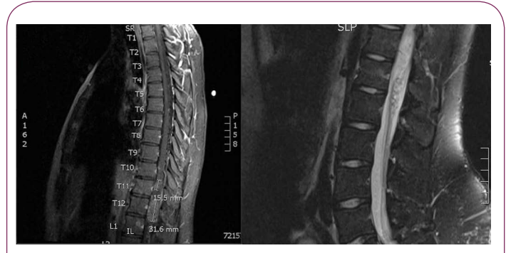
Figure 2 Magnetic resonance image of the spine. A. T1 contrast sagital view of thoracic spine showing 2 foci of intramedullary gadolinium enhancement associated with cord expansion at the levels of T11 and T12 may conceivably represent cord infarctions. B. T2 fat saturated sagital view of lumbar spine showing intradural vascularity along the dorsal thoracic spinal canal extending to the conus medullaris highly suspicious for an underlying AV fistula.

Given that this conus medullaris AVM was fed by a hypertrophied anterior spinal artery, an endovascular approach for treatment was not pursued. An open microsurgical resection was undertaken via a posterior approach to the thoracolumbar spine with bilateral laminoplasty from T11-T12, T12-L1, L1-L2 and L2-L3. Once the laminoplasty was removed exposing the dura, intraoperative ultrasound was then used to confirm presence of underlying spinal AVM. A long midline dural opening was then made. The microscope was subsequently used for the microsurgical