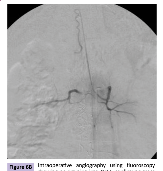
e 6B Intraoperative angiography using fluoroscopy showing no draining into AVM, confirming gross total resection.

Parkes weber syndrome was first described in 1907 by a dermatologist, Dr. Fredrick Weber [5]. He reported a syndrome involving proportionate hemi-hypertrophic limb with vascular