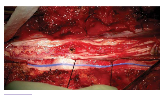
Figure 5 Gross total resection of AVM.

Figure 4 Tangle of vessels visualized immediately after the dural opening extending from the conus medullaris distally. The perimedullary veins proximally also appeared arterialized and reddish in color. Surrounding nerves appeared to be adherent to this tangle of vessels and also appeared to involve the filum.