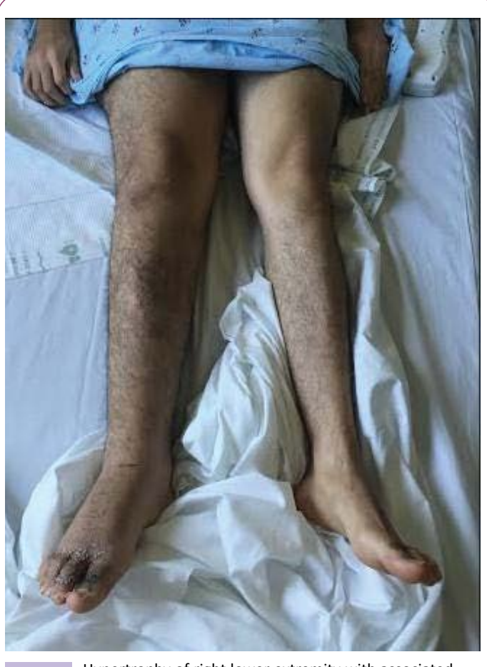
Figure 1Hypertrophy of right lower extremity with associated<br/>papules consistent with lymphangioma.

stain on his right buttocks and varicose veins on his right hip (not pictured). Dermatology evaluated the patient and reported innumerable papules consistent with lymphangioma.