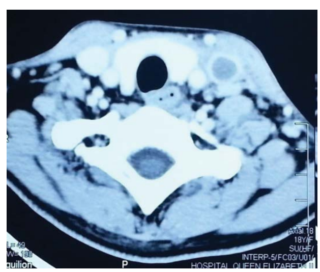
Figure 4 CT neck demonstrating a complete thrombosis of the left jugular vein from the base of the skull to its termination at the sub-clavian vein.

the patient's progress showed a significant improvement. She was also treated with IV Heparin for the IJV thrombosis. She was subsequently discharged home well with oral antibiotics of cefuroxime for a total of 6 weeks duration as well as oral Warfarin. The patient was followed up in our outpatient clinic whereby a repeated CT brain after 2 weeks of treatment showed near complete resolution of the intracranial empyema and a Doppler Ultrasound also didn't reveal any propagation of the IJV thrombosis.