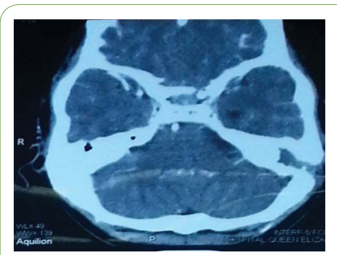
Figure 1 CT brain showing fluid within the left middle ear and within the left mastoid.