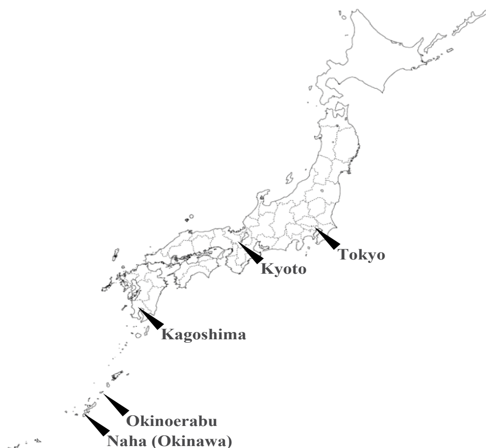
Figure 2 Location of Okinoerabu.

angiography [2,3], autopsy [4], and MRA [3,5-8]. The prevalence of UCAs in angiography studies tended to be higher than that in autopsy and MRA studies [9,10]. On the other hand, Gibbs et al. reported that MRA with 1.5-Tesla and 3-Tesla MR systems could demonstrate all aneurysms that had already been identified by angiography [11]. Recently, MRA has become the most popular tool to detect UCAs as it is a non-invasive and repeatable procedure. A high-tesla MR system could provide better image quality, leading to a higher rate of UCA detection [6,11]; however, the prevalence of UCAs in our study was higher than that using MRA with a 3-Tesla MR system [8]. Therefore, the magnetic field intensity and detection rate of UCAs might not be correlated.